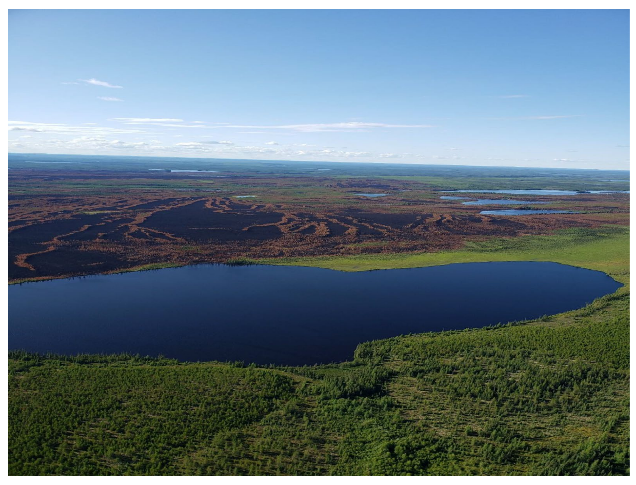
Figure 1: View of the Hook Lake Project